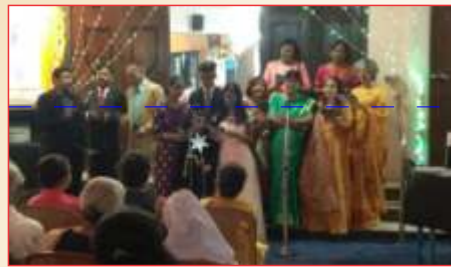
Holy Family Community