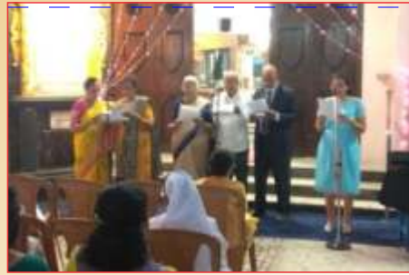
St. Paul's Community