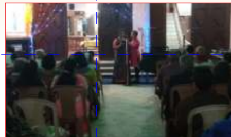
St. Joseph's Community