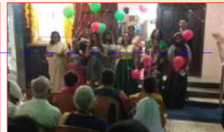
St. John Bosco Community