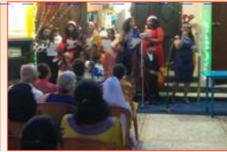
St. Jude's Community