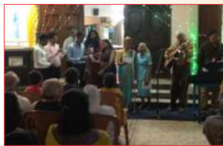
Our Lady of Fatima Community