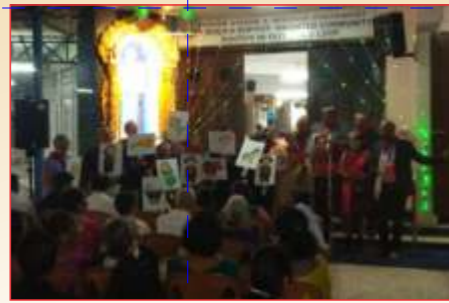
St. Anthony's Community